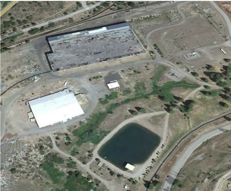
Google Earth Image of Warehouse of Interest