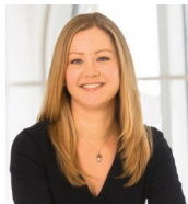
Hon. Sage M. Sigler U.S. Bankruptcy Court for the Northern District of Georgia SPEAKER