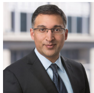
Neal Katyal Hogan Lovells Former Acting Solicitor General of the United States SPEAKER

This plenary will focus on the key decisions from the post-Kennedy Court, discuss trends in the decisions, and look forward to what may be coming next.